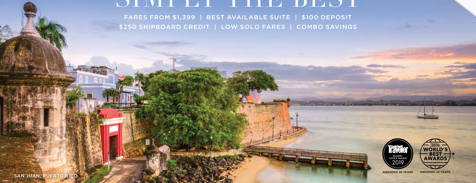
SAN JUAN, PUERTO RICO

FARES FROM $1,399 | BEST AVAILABLE SUITE | $100 DEPOSIT $250 SHIPBOARD CREDIT | LOW SOLO FARES | COMBO SAVINGS